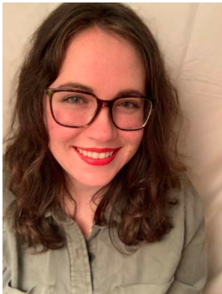
Gina K. Miller